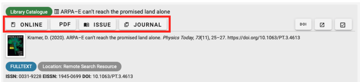
Figure 3: eReserve Plus Librarian Interface: LibKey Icons - Find an Existing Reading

Along with being shown when performing a search using "Find an Existing Reading" searching connected repositories or the eReserve Plus repository.