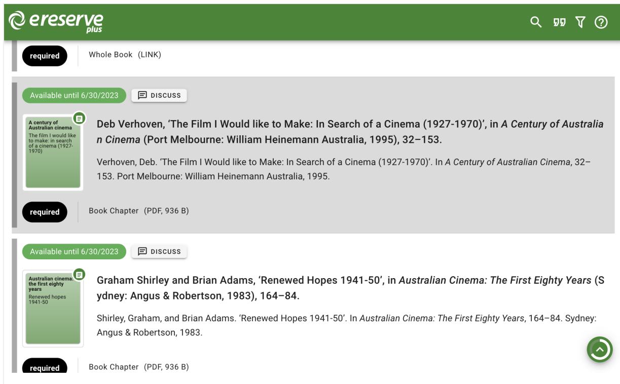
Figure 1: Student Interface - Resource List

If the resource is link-based, it will automatically open the link into a new tab in your browser.