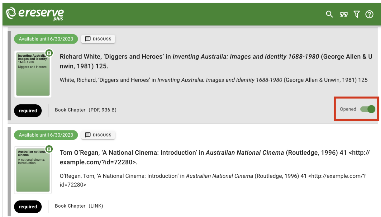
Figure 1: Student Interface - Opened Resources

Each time you access a resource, a button toggle will appear on the bottom right corner of the resource indicating that this resource has been opened. The toggle button will automatically be updated each time a resource is opened, making it easier for you to carry on with your learning resources.